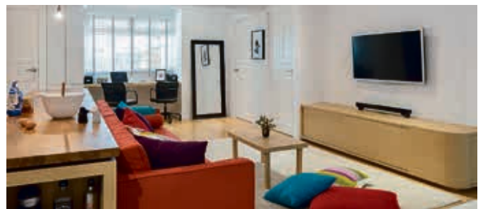
A sanguine red sofa adds colour, and is complemented by a rainbow of scatter cushions