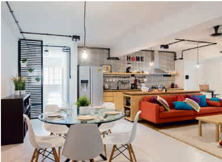
Walls were torn down, rooms were combined and the layout was drastically altered to achieve this bright and spacious interior – the living area, dining room and kitchen all sit comfortably next to one another

Our popular section continues with more inspiring ideas and home makeovers