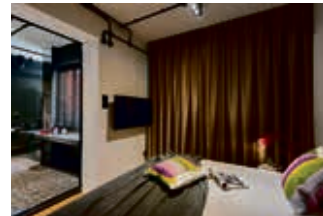
An opening leads into the adjacent room, converted into a walk-in wardrobe and bathroom